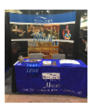
SSU CASMEC 2020 booth

Another benefit from this series is that it creates relationships between students that can last further into our careers. Networking with a wide variety of musicians is never a bad idea and we tend to forget that we should be building connections not only with established teachers, but with other students like ourselves. With the shift to an online lifestyle, we've never had a better (and easier) opportunity to network with other music programs.